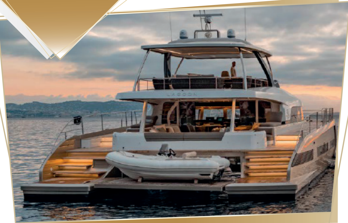
THE BOAT IS EQUIPPED WITH A TENDER HIGHFIELD®